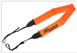
Floating Neck Strap