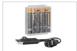
4 Re-Chargeable Li-Ion AA Batteries 1 USB-C Charging Cable