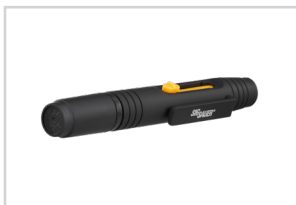
Marine Grade Lens Pen