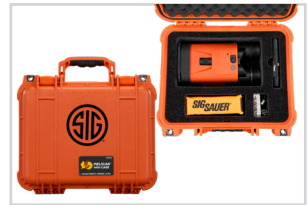
Waterproof Pelican Case with Laser Cut Foam

INCLUDED ACCESSORIES: Orange Waterproof Pelican Case SIG SAUER High Visible Floating Neck Strap 4 Re-chargeable AA Batteries 1 USB-C Charging Cable 1 Marine Grade Lens Pen